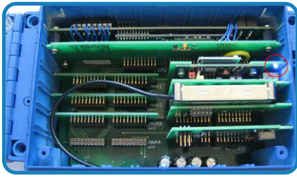
Blue LED on: bluetooth mode